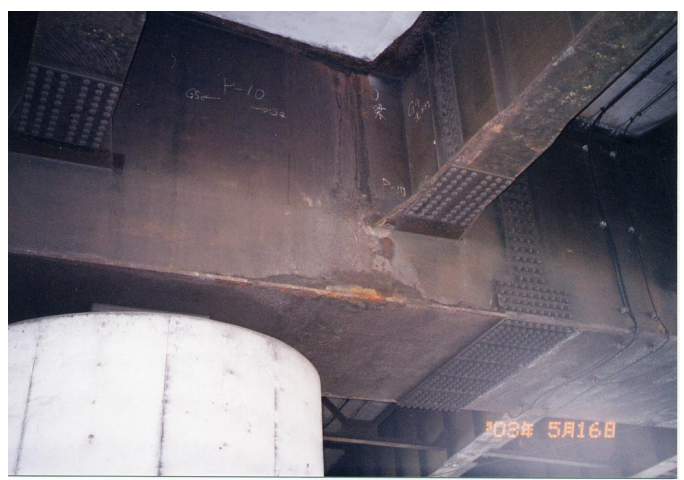
Figure 5. Viaduct Using Weather Resistant Steel.

This may be a good case history and should be considered for presentation in the next UNJR Bridge Workshop.