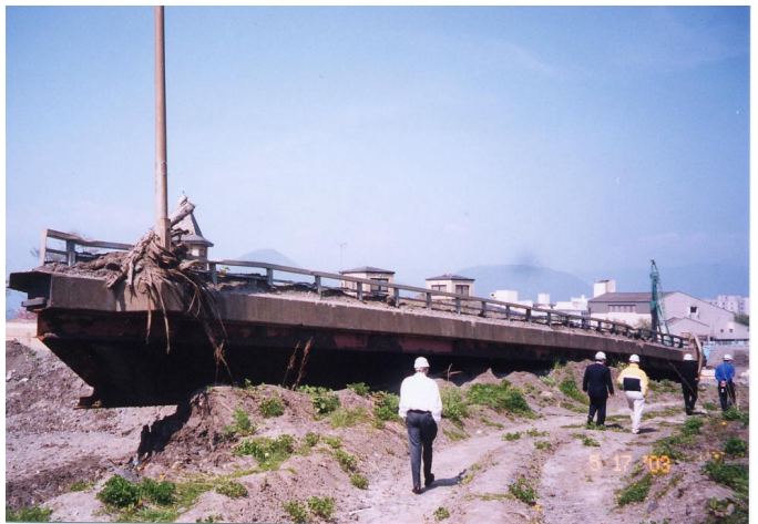
Figure 7. Bridge Washed Away by Mudflow.