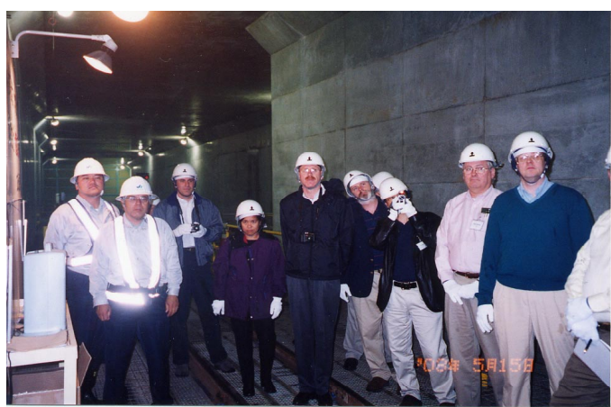
Figure 1. Delegation at the Tsukuba Underground Station.

aesthetic purposes an open plaza area of dimension 19 m x 50 m at one end. Underground tunnels were formed with 7.3 m diameter shield tunnel boring machines and at the Tsukuba Station they cut at the rate of 3 cm/min.