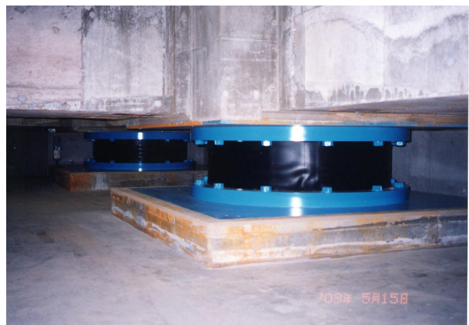
Figure 2. Rubber Isolator.