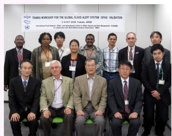
The course participants with ICHARM staff

ICHARM will continue to carry out this type of training courses to promote further installation of flood forecasting systems worldwide.