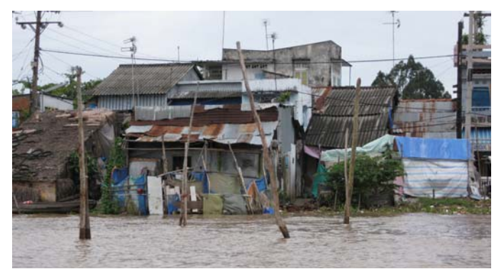
Vulnerable houses in the Mekong River Delta