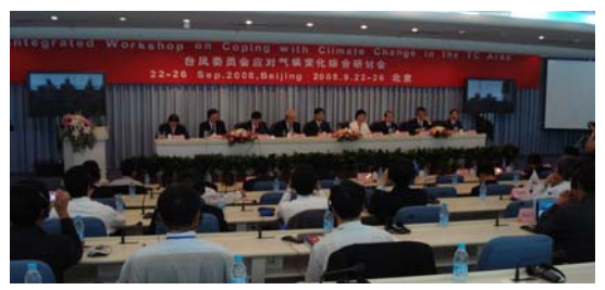
The workshop in session

The Integrated Workshop of the ESCAP/WMO Typhoon Committee (TC) was held on 22-25 September in Beijing. Representatives from 14 TC member countries participated. The workshop was convened to develop