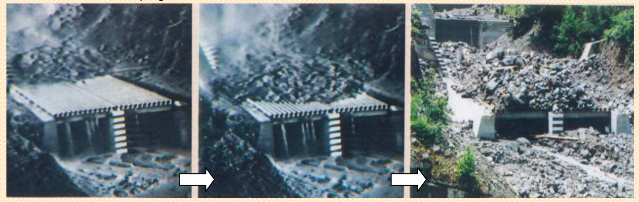
Debris-flow dewatering dam at work (Matsumoto sabo office, MLIT)

Debris-flow brakes are considered to efficiently prevent sediment-related disasters in mountain terrains and residential areas anywhere in the world, especially in developing countries, because they can be cost efficient, simply designed, easily repaired and maintained if size and location are well planned before construction. The ongoing pilot project in the Philippines is a collaboration among ICHARM, ADB and the Philipines' Flood Control and Sabo Engineering Center of the Department of Public Works and Highways to further demonstrate the practical efficiency of debris-flow brakes in developing countries.