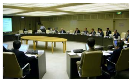
The board meeting in session

ICHARM is planning to publish the "ICHARM Action Plan 2008-2010" after reviewing the plan based on comments and advice from the board members.