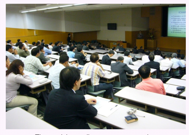
The participants listen to a presentation