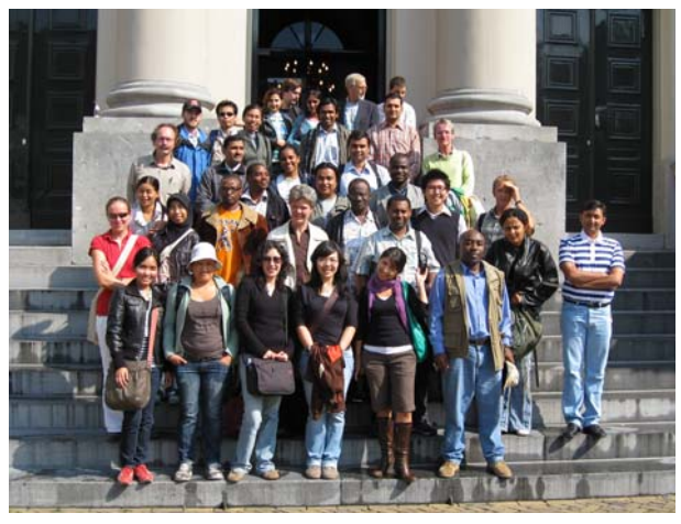
Course participants including instructors stand in front of the Dordrecht Municipality Building, Dordrecht, the Netherlands

Although the titles were different, both courses actually dealt with climate change impacts and adaptation measures in the water sector. The first one was lecture-oriented while the second was practice-oriented. For the practice, the participants were divided into small groups to work on problems concerning water input and demand under different climate scenarios. Simulations were carried out for a virtual environment called the "Republic of Climate Land." The participants were advised to focus on climate change impacts and adaptation measures in the water sector in the upstream-downstream situation of the imaginary country. There were about 20 participants, and most of them were trainees currently involved in a Master's course at UNESCO-IHE.