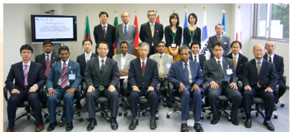
Group Photo at the Opening Ceremony