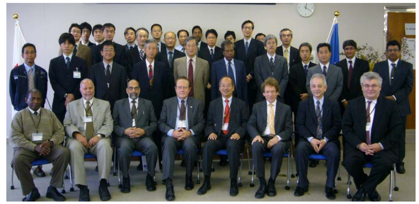
The board members and other participants smile for photos.

ICHARM, established under the auspices of UNESCO, is required to have a biennial advisory board meeting, in which ICHARM reports activities during the previous two years and presents an action plan for the next two years. The board members ask questions and give advice to help ICHARM take necessary action effectively with a clear vision.