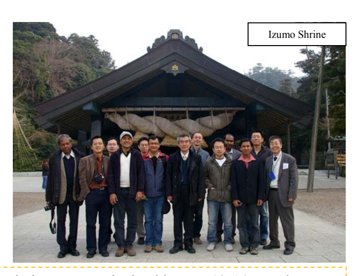
Field Trip in Izumo and Hiroshima on 12-14 March