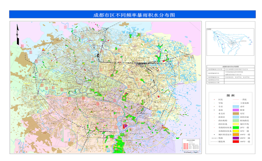
Example 2: FHM practices in EenZhou city.

WenZhou city is located in east China. It is often attacked by typhoon from west Pacific Ocean. So FHM for WenZhou city mainly considered rainstorm caused by typhoon.